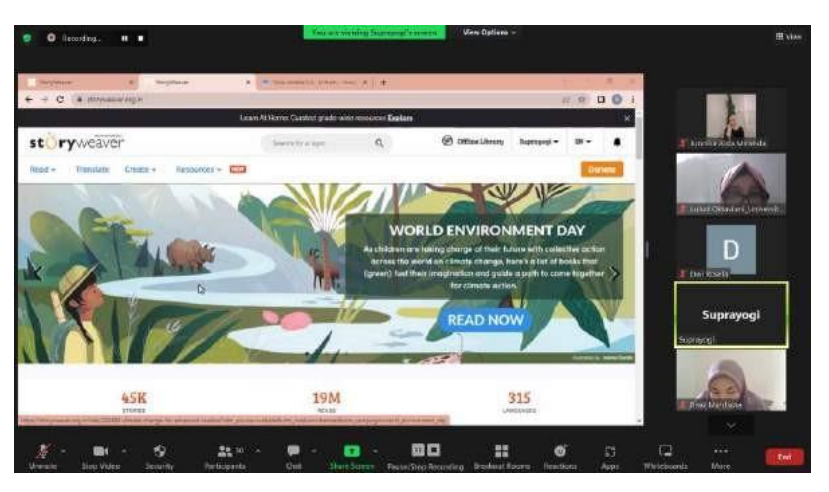
Figure 2. A synchronous meeting of implementing storyweaver.org.in

In the planning stage, a synchronous meeting was conducted via zoom meeting to explain how to create storybooks using storyweaver.org.in , what kind or theme of the story they have to create, a group they belong to, and a timeline of the project.