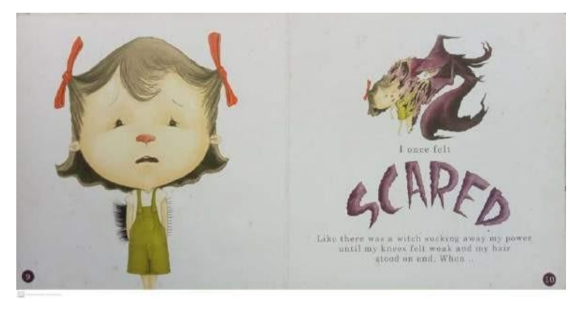
Figure 1. An English Storybook for Children

The picture above shows diction errors in children's books. "My hair stood up" is a disclosure of "goosebumps".