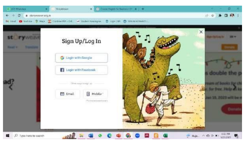
Figure 4. Creating a Story page of storyweaver.org.in

Figure 3. Register/Login page of storyweaver.org.in